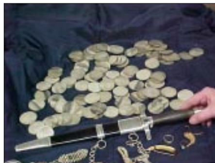
Unclaimed property items as they are prepared for auction.

As a result, the reports for periods ending in 2002 and 2003 will each include dormant property for a two-year time span and will likely include twice the amount of property normally reported. For information, call 410-767-1700 or 800-782-7383.