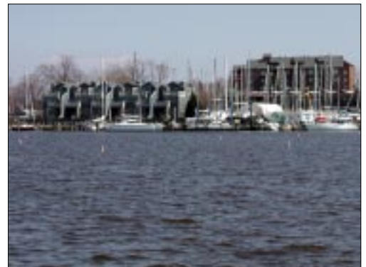
Mouth of the Severn River, Annapolis, Md.

Bay fund contributions on the 2002 state income tax re-