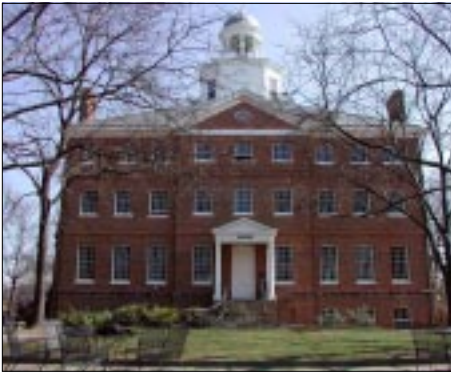
McDowell Hall, St. John's College, Annapolis, Md.

Contributions to the College Investment Plan are limited to $2,500 per year per account. In response to an opinion of the attorney general, the comptroller promulgated Regulation.15 under COMAR 03.04.02 that provides that the subtraction modification is limited to this amount per qualified designated beneficiary regardless of the number of investment options included in an investment account.