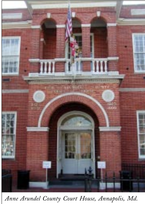
Anne Arundel County Court House, Annapolis, Md.