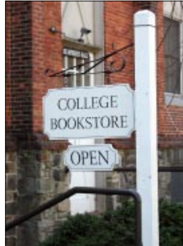
St. John's College, Annapolis, Md.

part of the plan. The taxpayer may take a similar deduction for each beneficiary for whom the taxpayer makes contributions."